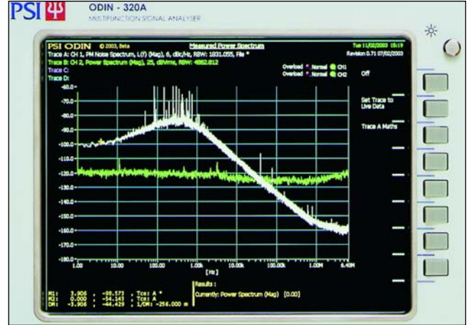
A detailed display permits fast and accurate evaluation during circuit development. Real-time measurement allows fast tuning and optimization.

with an integral bay for three plug-in modules. This modular architecture is easy to configure, and allows the user to buy only those modules suited to their specific functional and frequency requirements, or to expand to new features in the future. The ODIN-320A is capable of controlling up to seven external modules for added expandability.