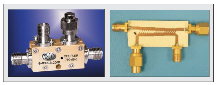
Here are two construction options for directional couplers. The MECA unit on the left is a classic design with a machined metal case. On the right is a printed coupler designed by Dana Brady of CAP Wireless, as described in the September 2002 issue of High Frequency Electronics . The design on the right could be included on a larger p.c. board with additional circuitry, or placed in its own connectorized package like the unit on the left.

There remain many applications for couplers with the highest possible performance, particularly in instrumentation. For example.