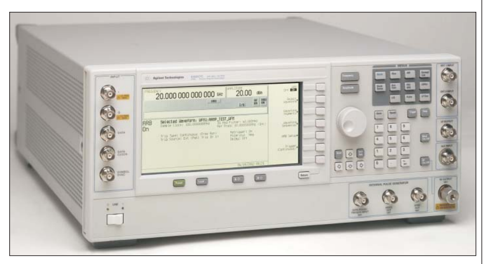
The E8267C makes it possible to generate vector-modulated carriers to 20 GHz using a single instrument.

and extends their extremely low trace noise and high dynamic range to 67 GHz.