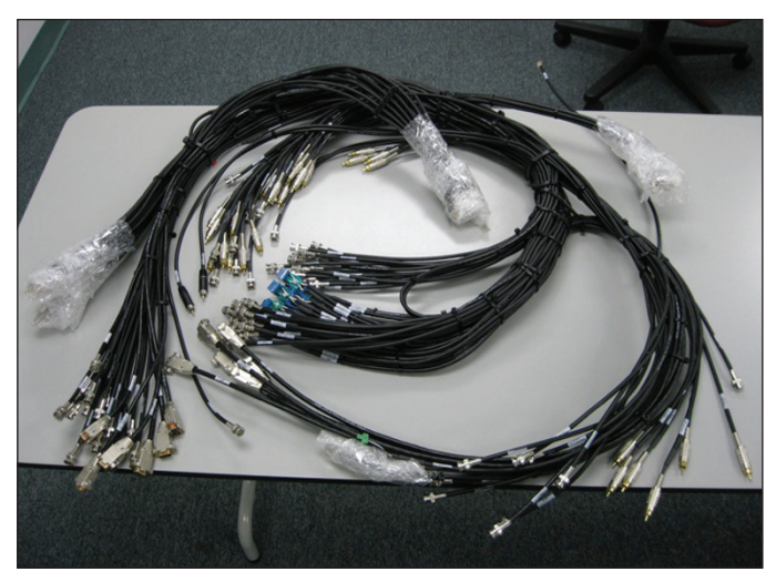
Figure 3 • Each completed assembly was installed onsite.