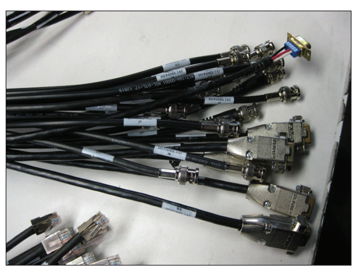
Figure 4 • Thirteen different types of connectors were used for each assembly.

vice. One cabinet was subjected to destructive survivability testing, including the effects of a submerged explosion. The cabinet and retrofitted cable assembly was satisfactorily retested.