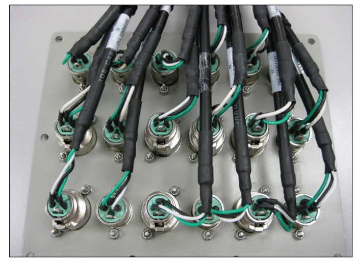
Figure 1 • A robust feed-through panel was vital for the vertical orientation of the installation.

obstructions and still be adequately strain-relieved. "We had to think in a completely different way to conceptualize what was needed," noted Lemuel Agustin, Value-Added Engineer. "We had to create something brand new, yet meet a very specific customer requirement." As such, each