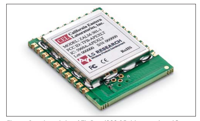
Figure 1 · A variety of ZigBee/802.15.4 transceiver ICs are available. Ember<sup>™</sup> combines an RF transceiver with a flash-based co-processor in its EM260 chip. The EM260 stores the ZigBee stack in its flash memory, but takes commands from the processor that is resident in the enduser system. CEL's Apex LT combines the EM260 with a 100 mW power amplifier in an easy-to-use, drop-in radio module. FCC, IC and CE certified, these modules are ideal for designers looking for fast time-to-market.

ZigBee PRO also employs asymmetric link handling. This optimizes link paths, which in turn leads to faster throughput and better reliability. A new many-to-one routing technique also helps minimize traffic in networks where multiple nodes report back to a single point, opening up more bandwidth for improved data transmission.