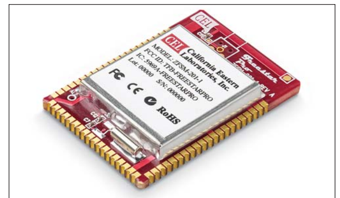
Figure 2 · The MC13224 from Freescale<sup>™</sup> is a single-chip platform-in-package (PiP) transceiver that integrates a 32-bit ARM7 processor. This powerful MCU, combined with generous on-chip memory, allows designers to run complex applications without the need for peripheral processing devices. CEL packages the MC13224 in its FreeStar PRO radio module. FCC, IC and CE certified, it eliminates the costly and time-consuming certification process.

802.15.4 is widely supported by semiconductor manufacturers, a good indication of its acceptance as a viable standard. Ember, Freescale, Texas Instruments, California Eastern Laboratories (CEL), and others offer a wide variety of transceiver and microprocessor ICs. Range extension components like LNAs, power amplifiers