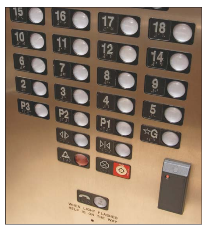
Figure 3 · New applications for control and communications over 802.15.4/ZigBee networks are rapidly emerging. In elevators, RS-485 cable runs can be complex, difficult to install, and expensive to maintain. 802.15.4 and ZigBee provide a means for replacing these old systems with simple, low cost, low power wireless control.