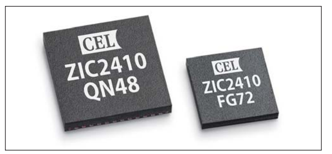
Figure 4 · As new applications evolve, they call for ICs designed to meet unique needs. CEL's low cost MeshConnect<sup>™</sup> ICs feature data rates to 1 Mbps and a unique onboard voice Codec. This allows them to transmit voice as well as low resolution video over 802.15.4/ZigBee mesh networks.

802.15.4 and ZigBee standards are gaining wide acceptance. In 2008, overall sales revenues for chipsets and modules increased by nearly 50% over the previous year. Some industry analysts are forecasting 2009 sales to nearly double the 2008 numbers. The 802.15.4 market continues to show strong growth, even during these try-