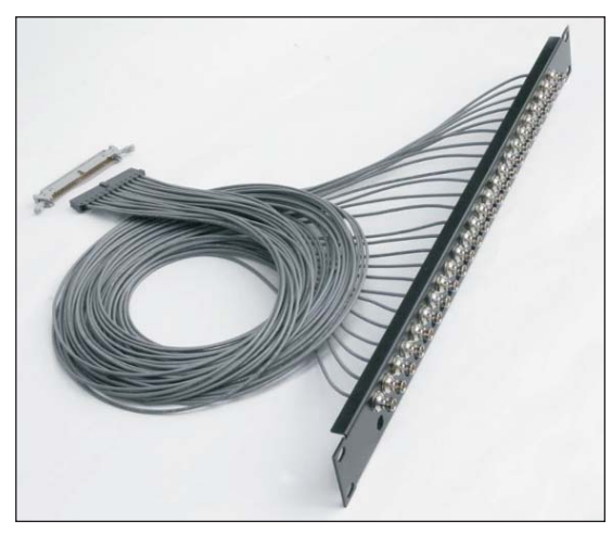
Figure 1 · This "octopus" assembly takes signals from a p.c. board multipin connector at one end and splits them into multiple coax connectors.

Higher data rates need better answers, even with forward error correction coding in place to "solve" network performance problems by retransmitting corrupted information.