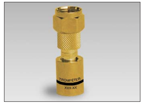
Figure 2 · An improved F connector with captive center conductor and gold plating.

Another issue related to "thinking upstream" that is often overlooked has to do with the physical working condi-