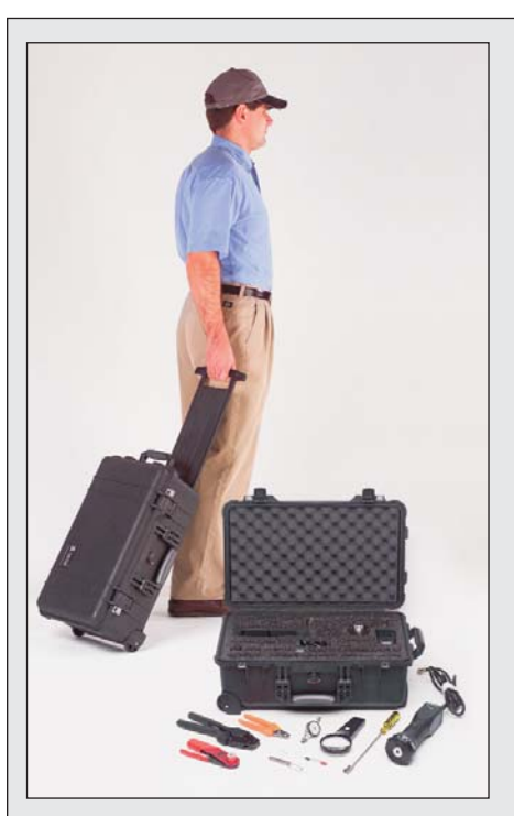
Figure 5 · High quality, reliable field installation of connectors requires a set of the manufacturer's installation tools, plus training in their proper use.

When installers complete their work and turn over their job site to an inspector for quality and conformance inspection prior to activating that portion of the network, several