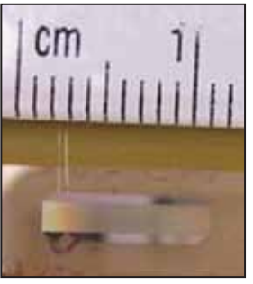
Figure 1 • Prototype sensor device fabricated at UMaine.

parameters such as temperature, humidity, pressure, and strain and send those values back in addition to the sensor tag number. RFIDs are read one at a time like barcodes, while passive sensors can be read in groups at the same time. The responses are then separated using signal processing techniques.