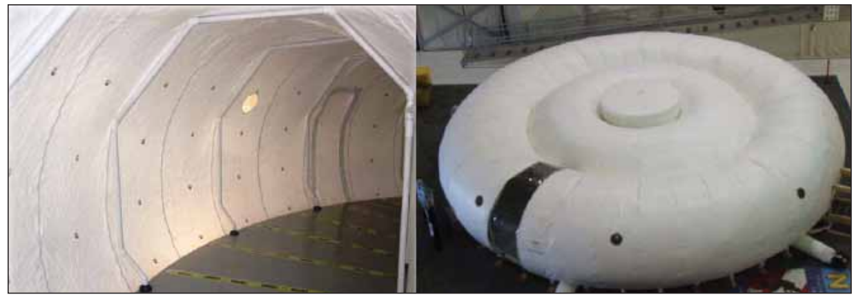
Figure 3 • NASA's Inflatable Lunar Habitat Module at UMaine.

Inside its Wireless Sensing Lab, the University of Maine hosts the first inflatable lunar habitat module built by NASA Johnson Space Center. This module was built in 2009 and delivered to UMaine to be outfitted with passive wireless sensors for structural monitoring. Figure 3 presents outside and inside views of this module that is outfitted with 124 passive wireless sensors for shape detection, leak detection, and impact localization. We have developed localization methods for sensors built at UMaine at 107