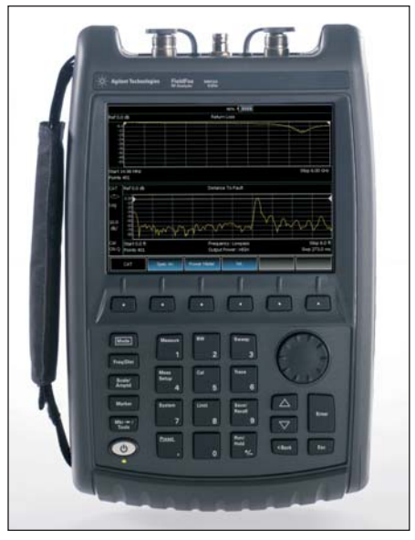
Figure 2 · The Agilent Technologies FieldFox Handheld RF Analyzer addresses the needs of Wireless Service Providers for an integrated solution for the installation and maintenance wireless networks.

Power meter with USB power sensor—FieldFox can connect with the Agilent U2000 Series USB power sensor to make RF/microwave power